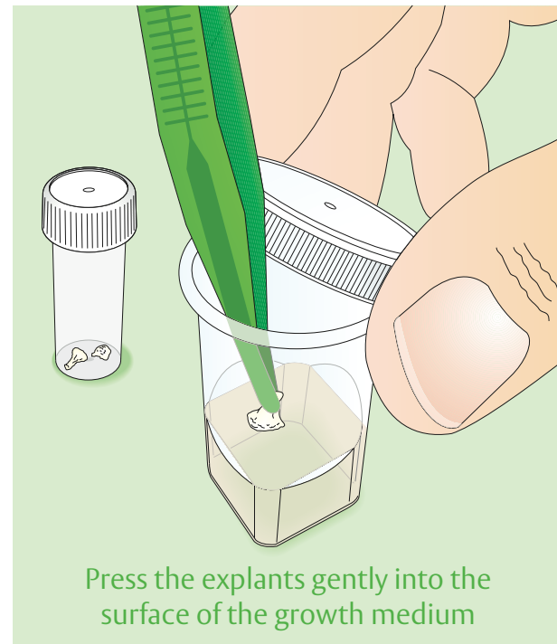
Press the explants gently into the surface of the growth medium