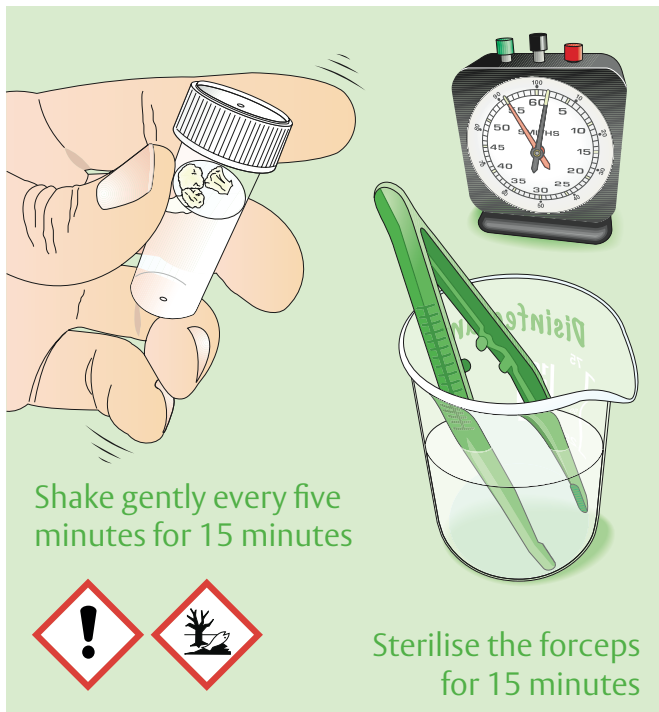
Shake gently every five minutes for 15 minutes