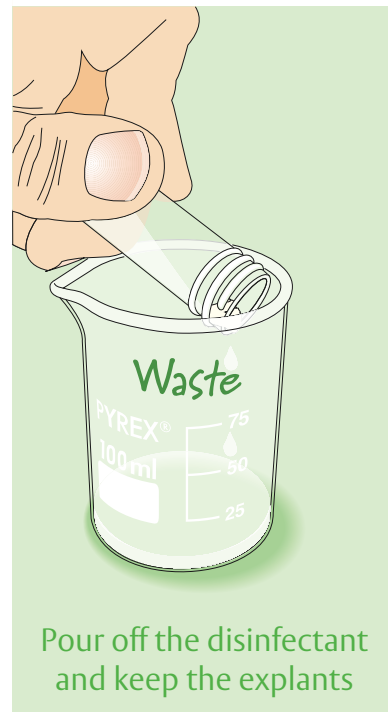
Pour off the disinfectant and keep the explants